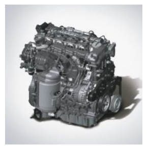
1.5I Diesel [6MT and 6AT]