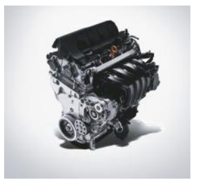
1.5I Petrol [6MT and IVT]